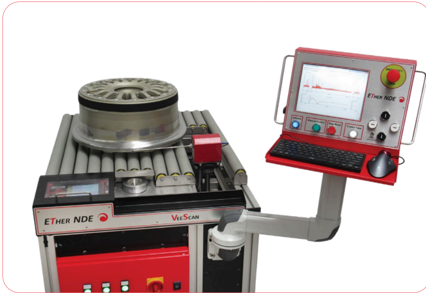
VeeScan Pivot Arm Option

At ETher NDE we understand that the key criteria for any Aircraft Wheel Inspection System is the need to guarantee detection of defects, the requirement to operate reliably twenty-four hours per day, 365 days per year. The demand for a simple and user-friendly interface and the business need to maximize speed of inspection and output is key. Balancing these objectives can be difficult, but we believe the VeeScan measures up to the task.